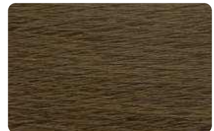
Design PVC Wood Turner Oak (ES2523)