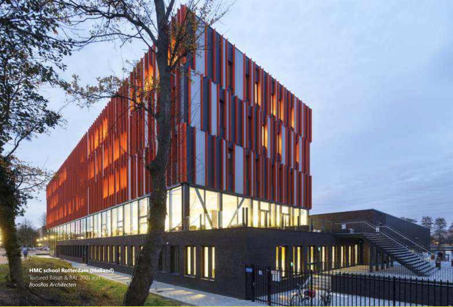
HMC school Rotterdam (Holland) Textured Basalt & RAL 2001 and 7016 RoosRos Architecten