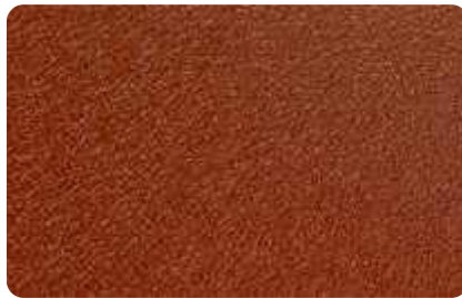
Textured Rough Terra Di Sienna Light (ES2499)