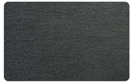
Design Textured Cityscape 392 (ES3418)