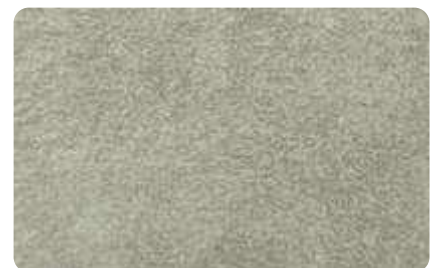
Design Urban Concrete (ES2146)