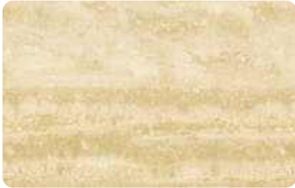
Design Travertine Marble (ES1674)