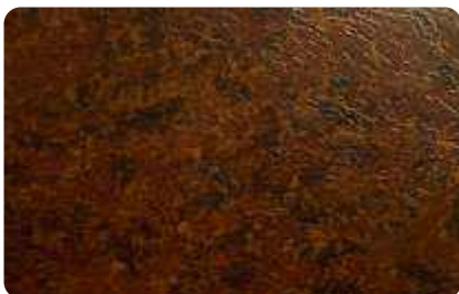
Design PVC Wood Avellino Rost (ES2106)