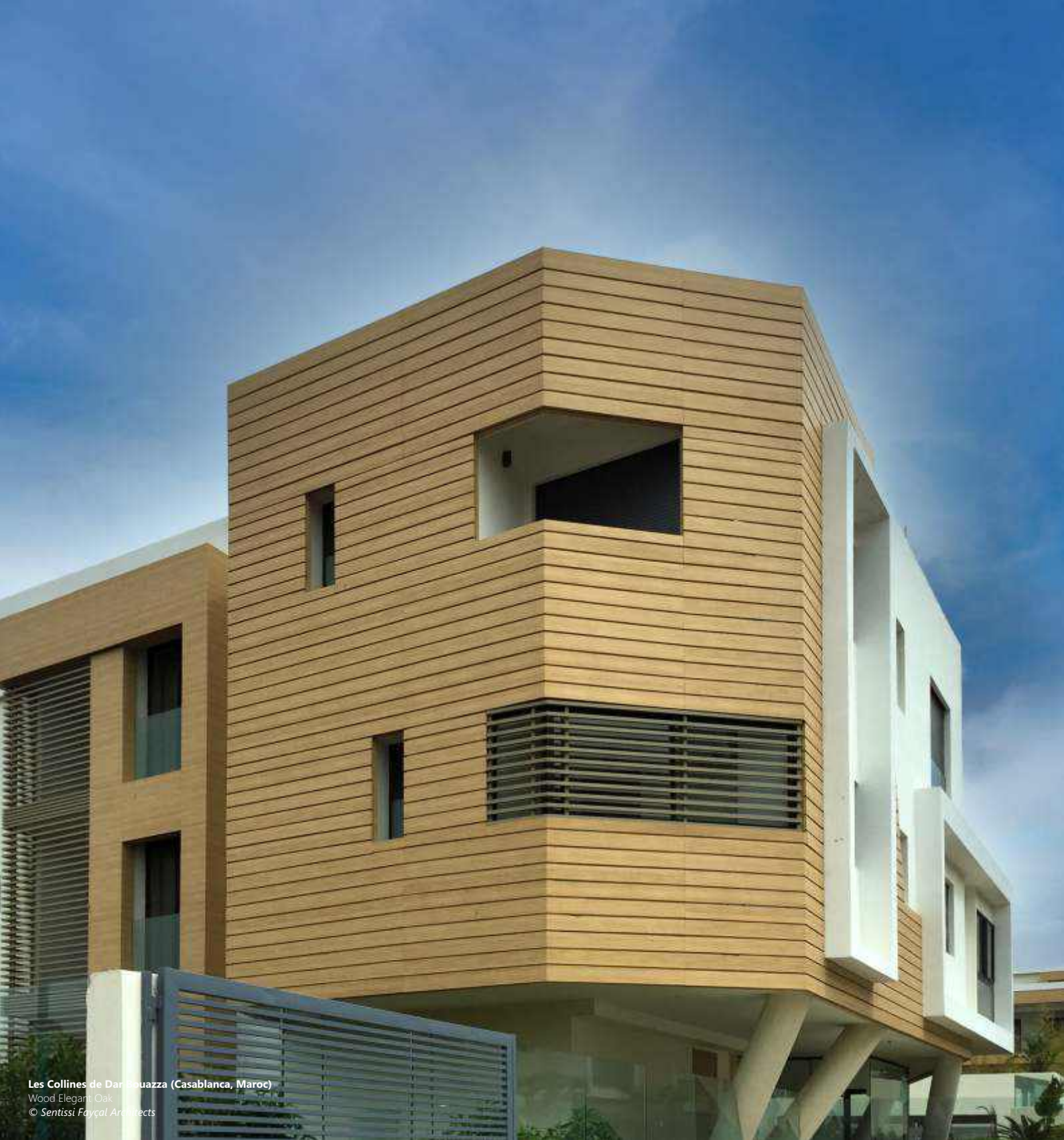
Les Collines de Dar Bouazza (Casablanca, Maroc) Wood Elegant Oak © Sentissi Fayçal Architects