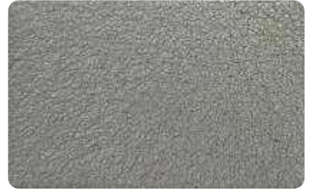
Textured Rough Silver Pearls (E2538)