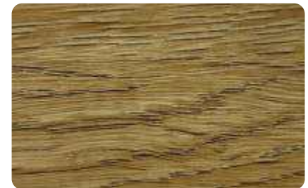
Design PVC Wood Malta Oak (ES2109)