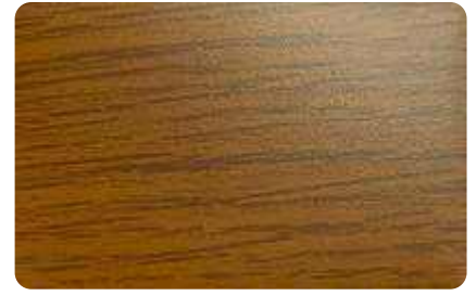
Design Wood Golden Oak (ES2161)