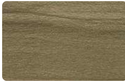
Design Wood Tender Oak (ES2510)