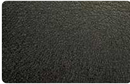
Textured Rough Boron (ES2498)