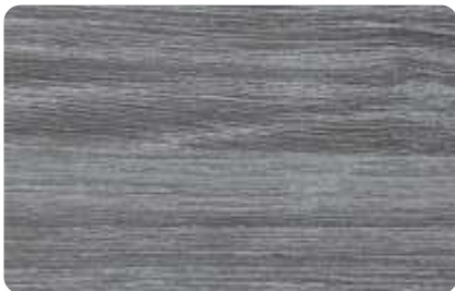
Design PVC Wood Concrete Oak (ES2107)

Check possibilities and properties concerning ACM PVC 200 \mu