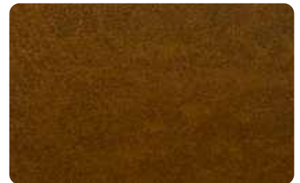
Design Aciero Corten (ES2190)