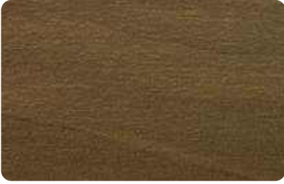
Design Wood French Walnut (ES2173)