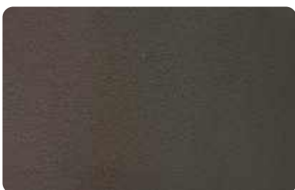
Texture Fine Brown Sepia 8014 ES2807