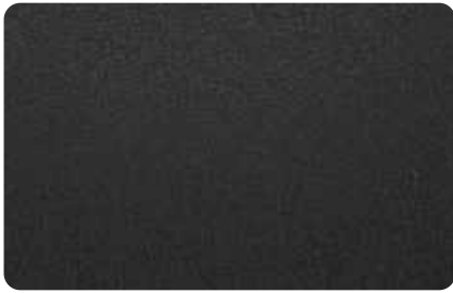
Textured Rough Anthracite Grey Pearls (ES3403)