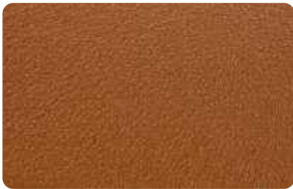
Textured Rough Terra Cotta Light (ES2500)