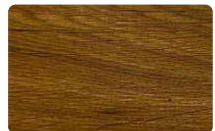
Design PVC Wood Honey Oak (ES3171)