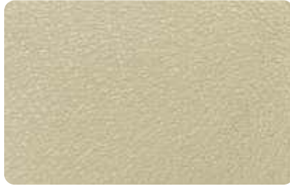
Textured Rough Shell (ES2503)