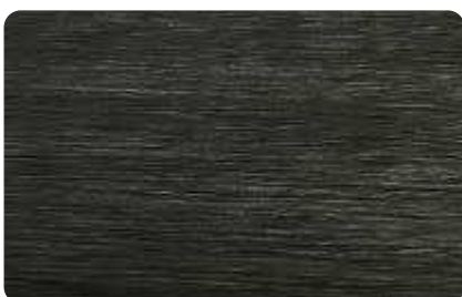
Design PVC Wood Truffle Oak (ES3169)