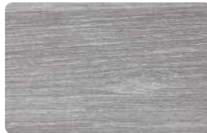
Design PVC Wood Alpino Oak (ES2108)