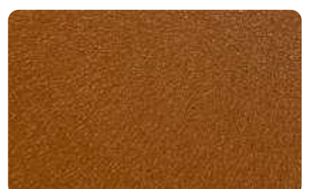
Textured Rough Spicy (ES2172)