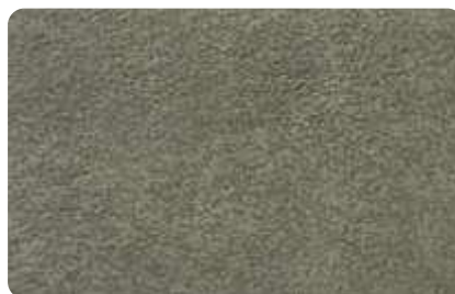
Design Industrial Concrete (ES2145)