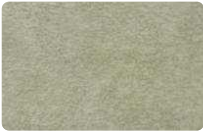
Design Moon Concrete (ES2520)