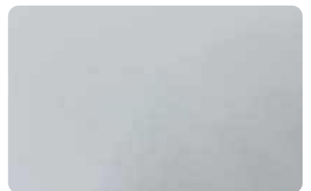
Texture Fine TeleGrey 4 7047 ES3308