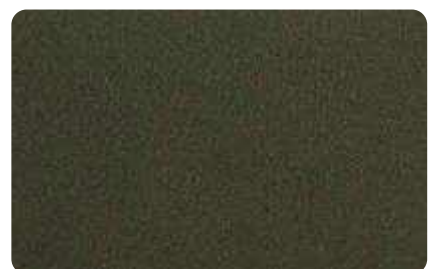
Textured Fine Umbra Grey 7022 (ES2831)