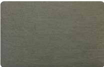
Design Zinc Patina (ES2153)