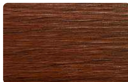
Design PVC Wood Cayenne Oak (ES3170)