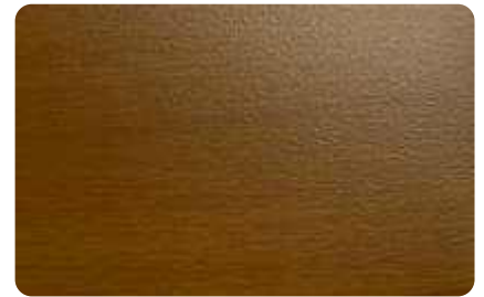
Design Wood Walnut Brown (ES2159)