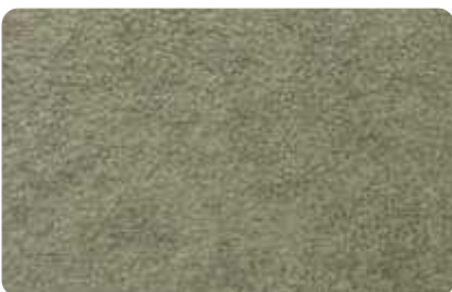
Design Washed Concrete (ES2262)