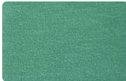
Design Copper Patina (ES2164)