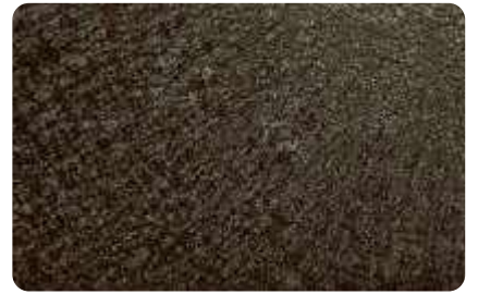
Textured Rough Cocoa (ES2171)