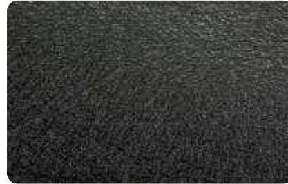
Design Textured Basalt (ES1652)