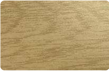
Design Wood Pale Oak (ES2151)