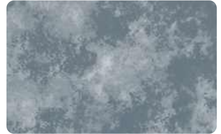
Design Spotted Concrete (ES1689)