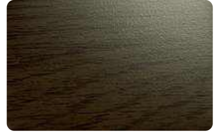
Design Wood Dark Oak (ES2541)