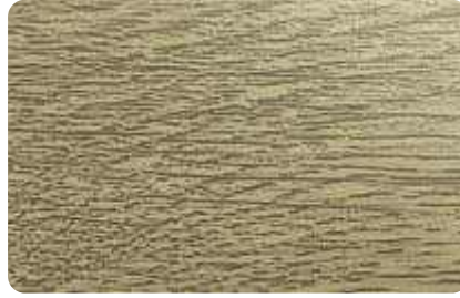
Design Wood Birch Oak (ES2529)