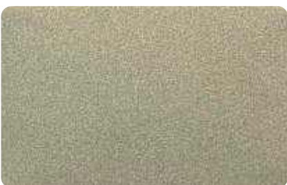
Textured Fine Aluminium Grey 9007 (ES2815)