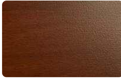
Design Wood Colonial Red (ES2160)