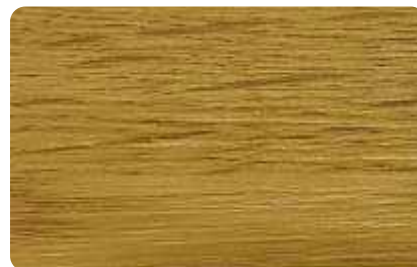
Design PVC Wood Ginger Oak (ES2522)