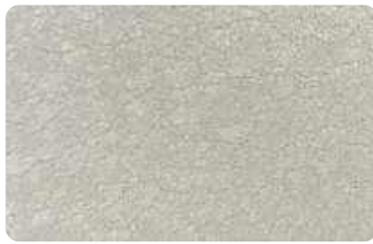
Design Textured Glistening Snow (ES3147)