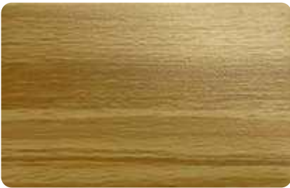
Design Wood Koya Line (ES2516)